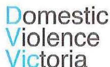
Peak body for domestic violence services for women & children