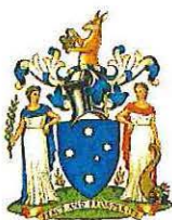
Magistrates' Court of Victoria