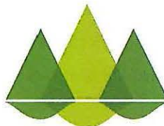
Federation of Community Legal Centres VICTORIA