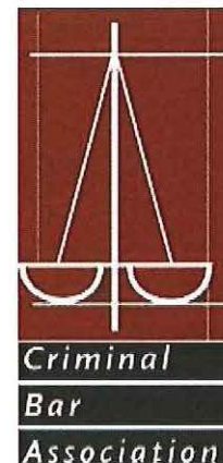
Criminal Bar Association