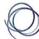
No To Violence Male Family Violence Prevention Association